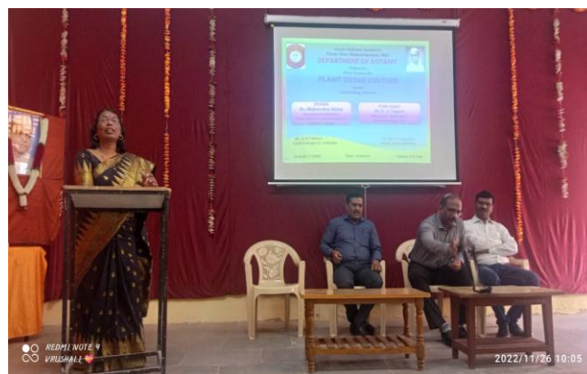
Introducing and Welcoming